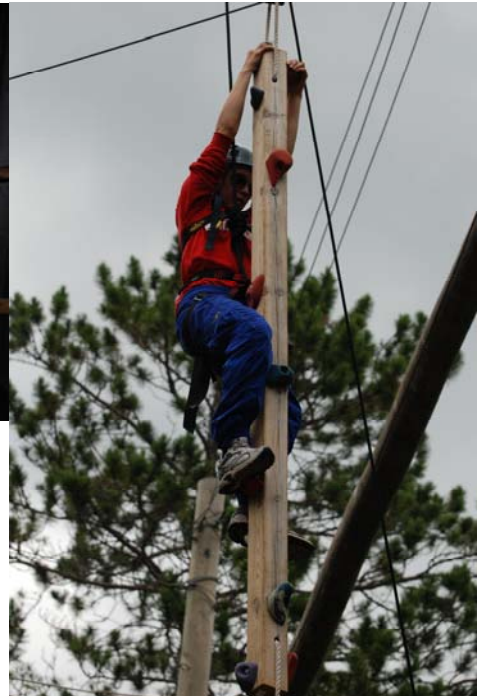
A Macdonald SHSM student on the high ropes course.