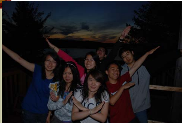
Macdonald SHSM students at Bark Lake Leadership Centre.