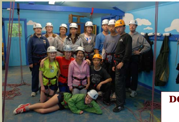
Above: Bark Lake Leadership Centre.