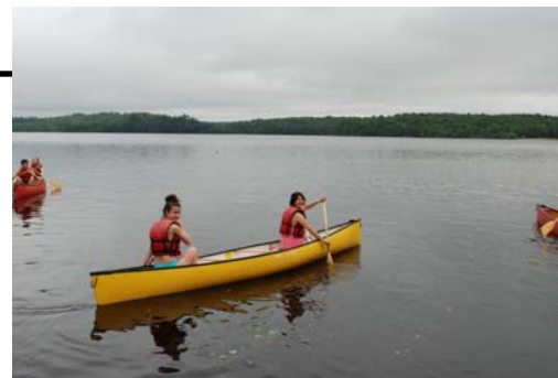
Macdonald SHSM students earn their Paddling Skills Certification.